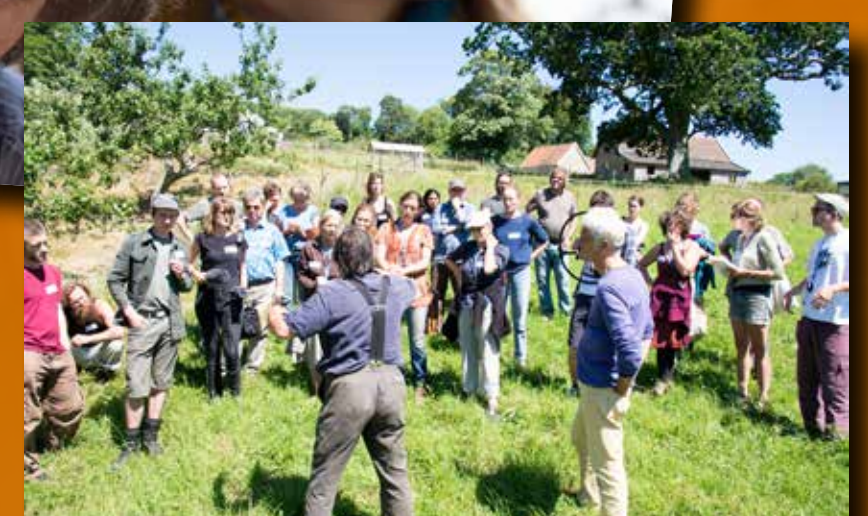
Workshop at Monkton Wyld Court, in the UK, location of agroecology training centre called Landbase