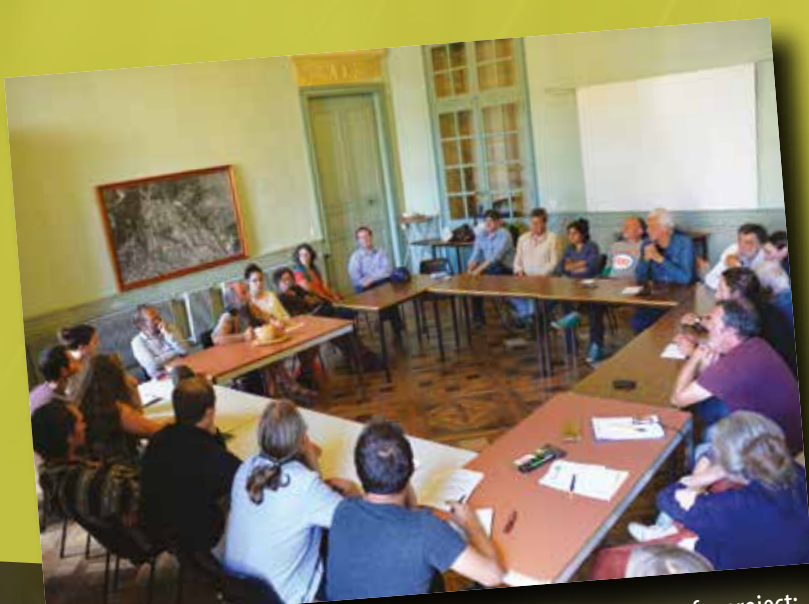
Farmers and researchers meet in France for project: DARE - Democratising Agriculture Research In Europe

Get Involved to enable the exchange of experiences, cooperation and solidarity. contact us at info@eurovia.org